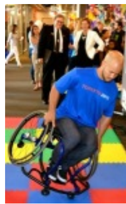
Parapan Am Countdown