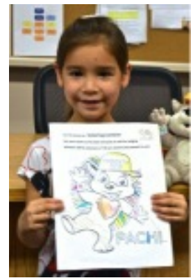
Caring Together Week