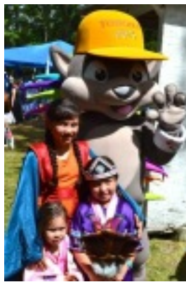
Spreading the Pan Am message